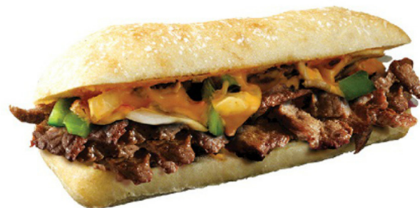
Big Al's Philly Steak 100g x24